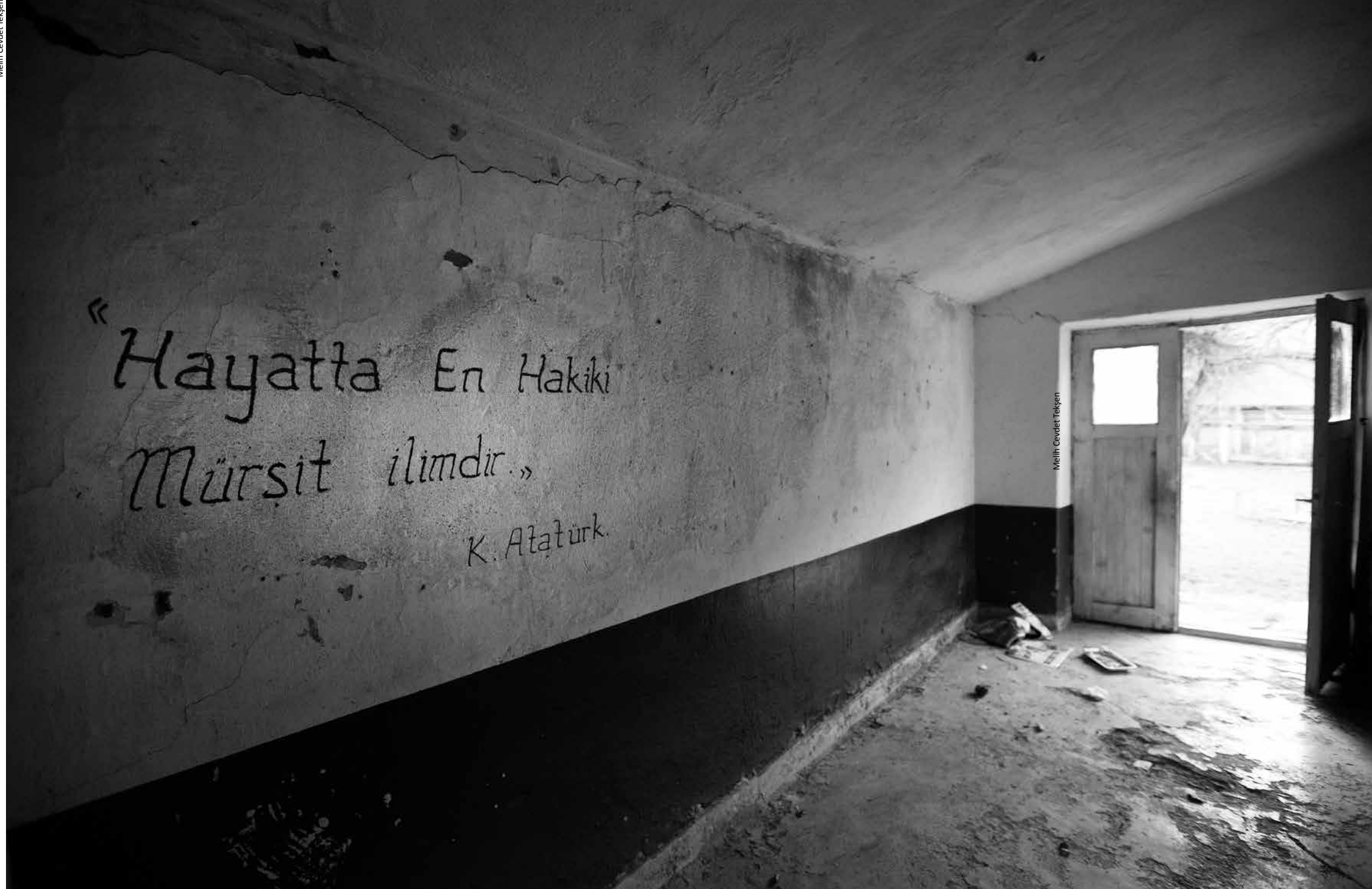
Melih Cevdet Tekşen