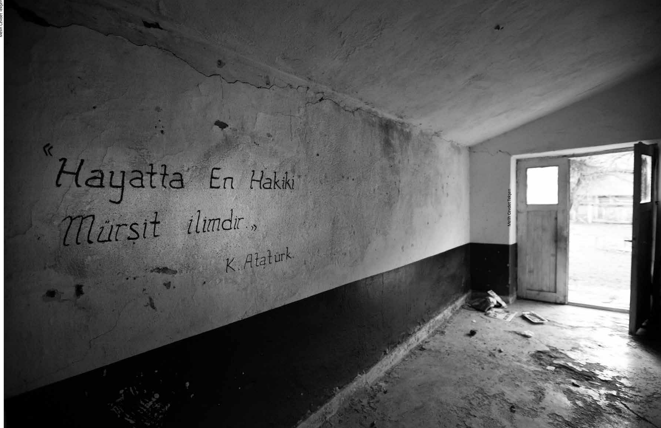
Melih Cevdet Tekşen