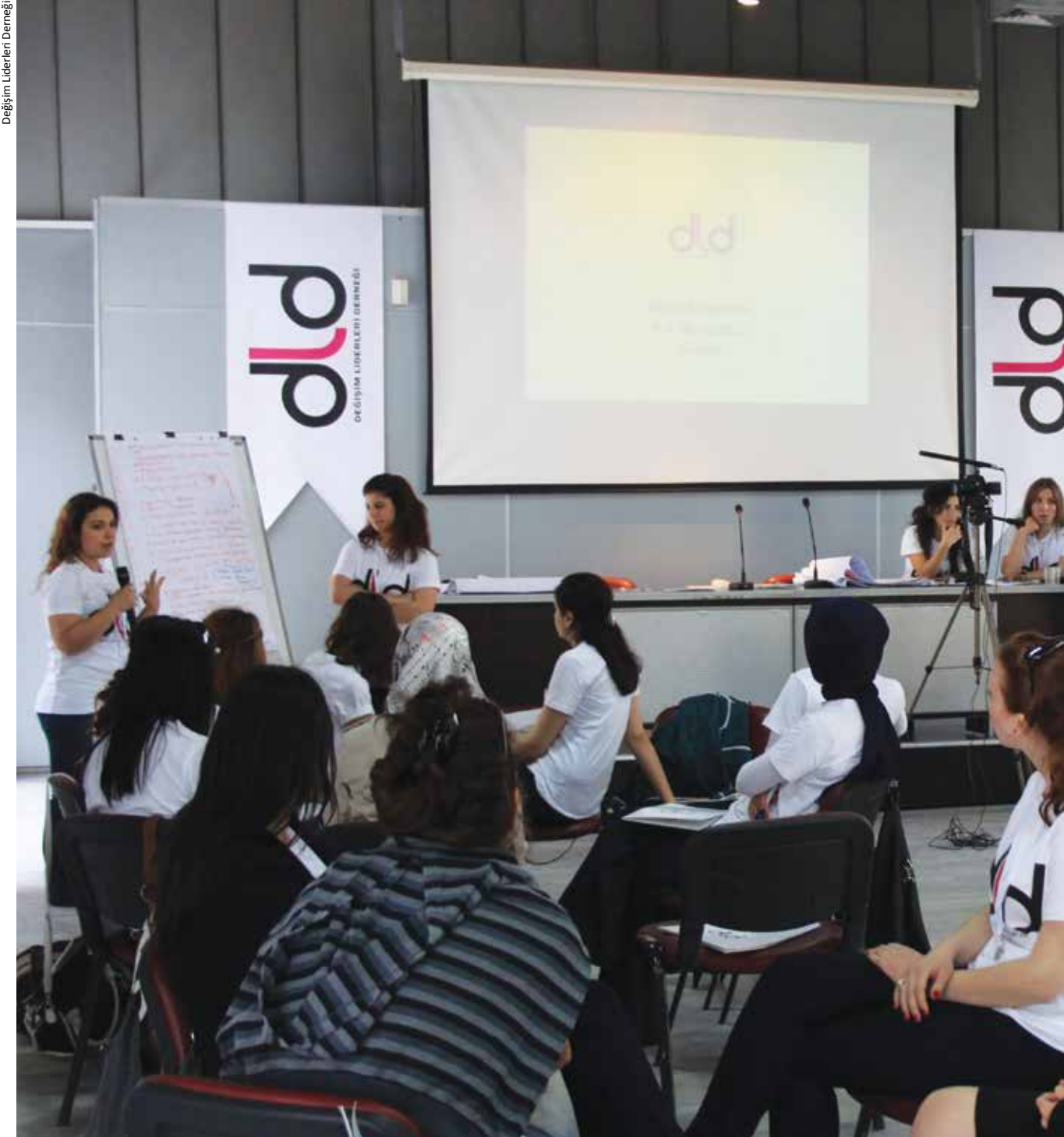
Change Leaders Association Workshop