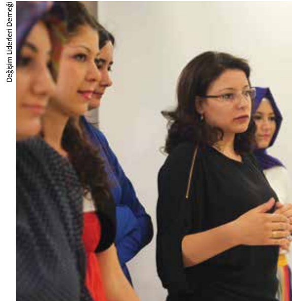
Change Leaders Foundation Speaker