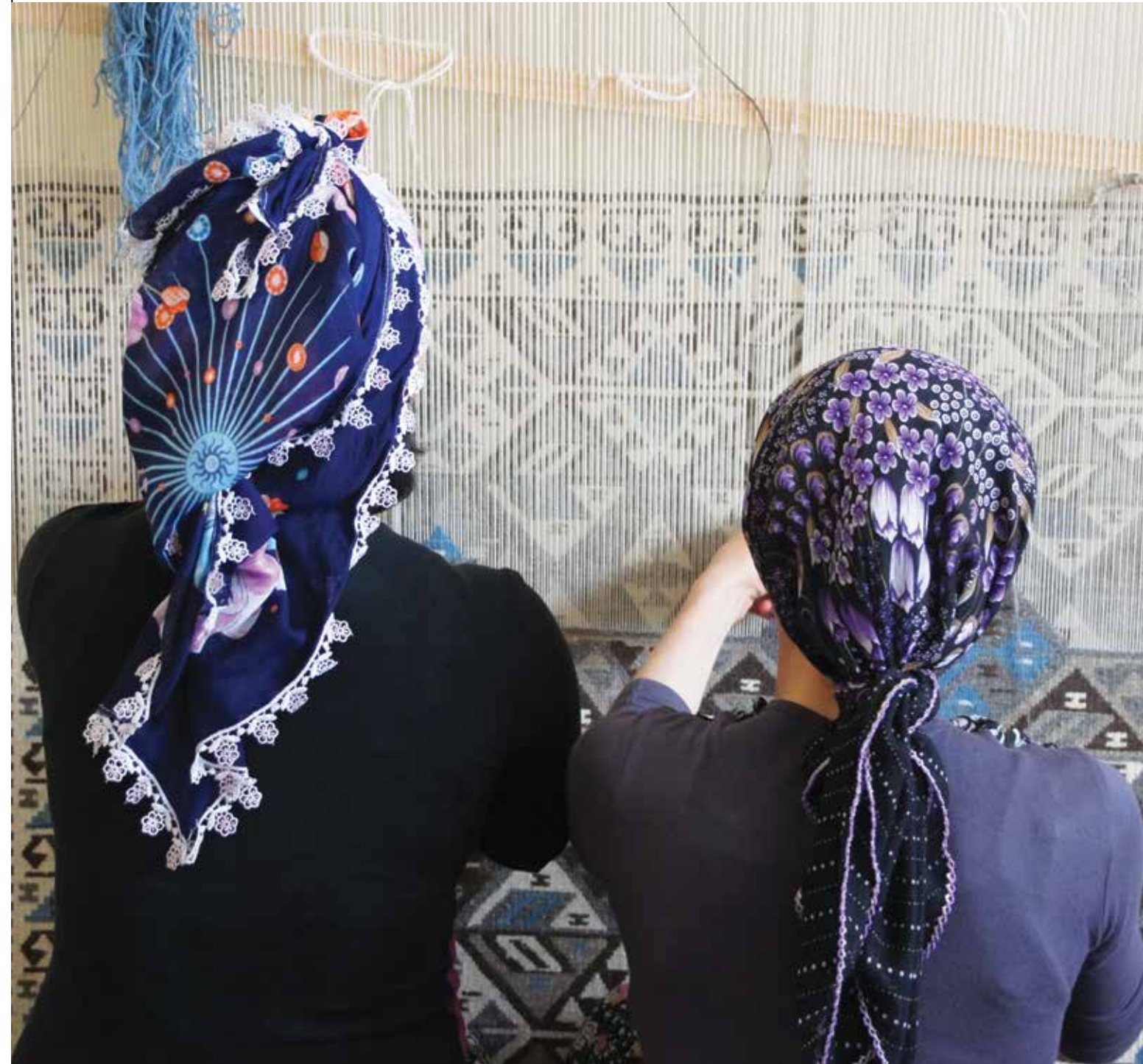
Hisar Anatolian Support Society Kilim Workshop

Hisar Anatolian Support Society empowers women by generating income and creating employment for women of East Anatolia through training on handmade carpets and kilim. The kilim studios built by the Hisar Society targets women and girls who had to migrate to big cities due to terrorist activities in their villages.