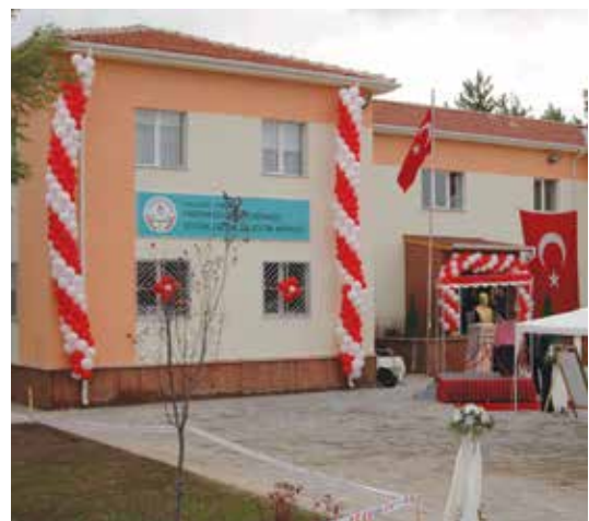
Special Needs School Opening in Eskişehir