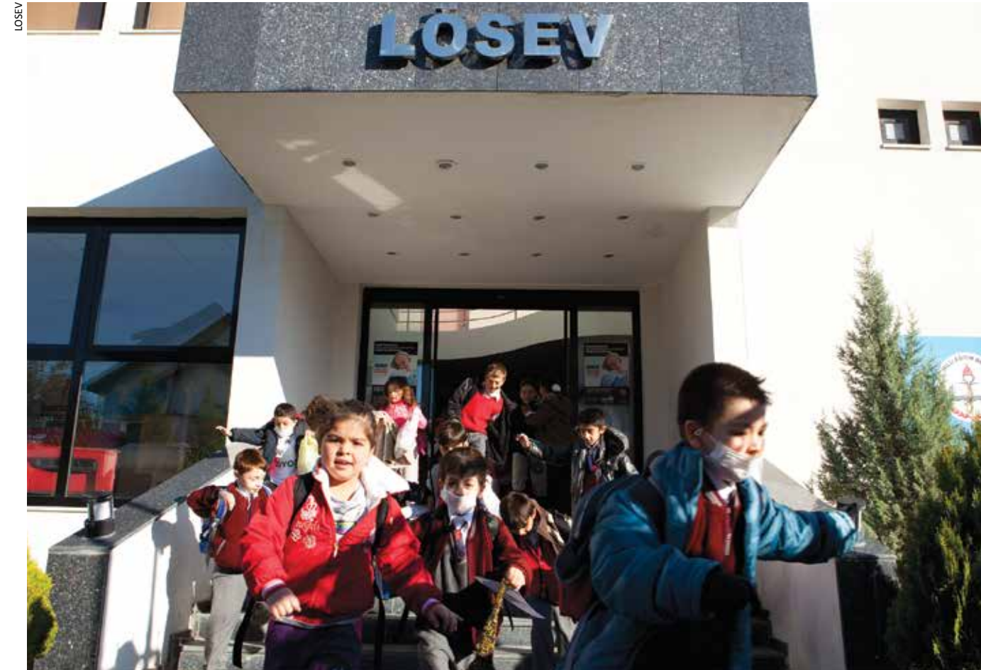
LÖSEV Angora School