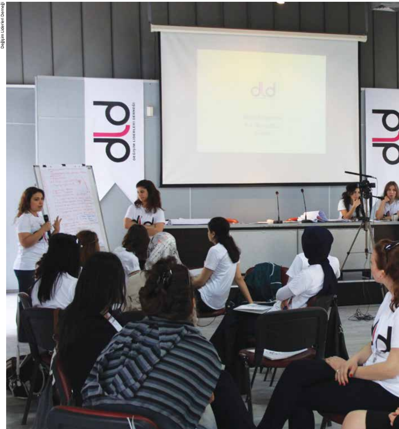
Change Leaders Association Workshop