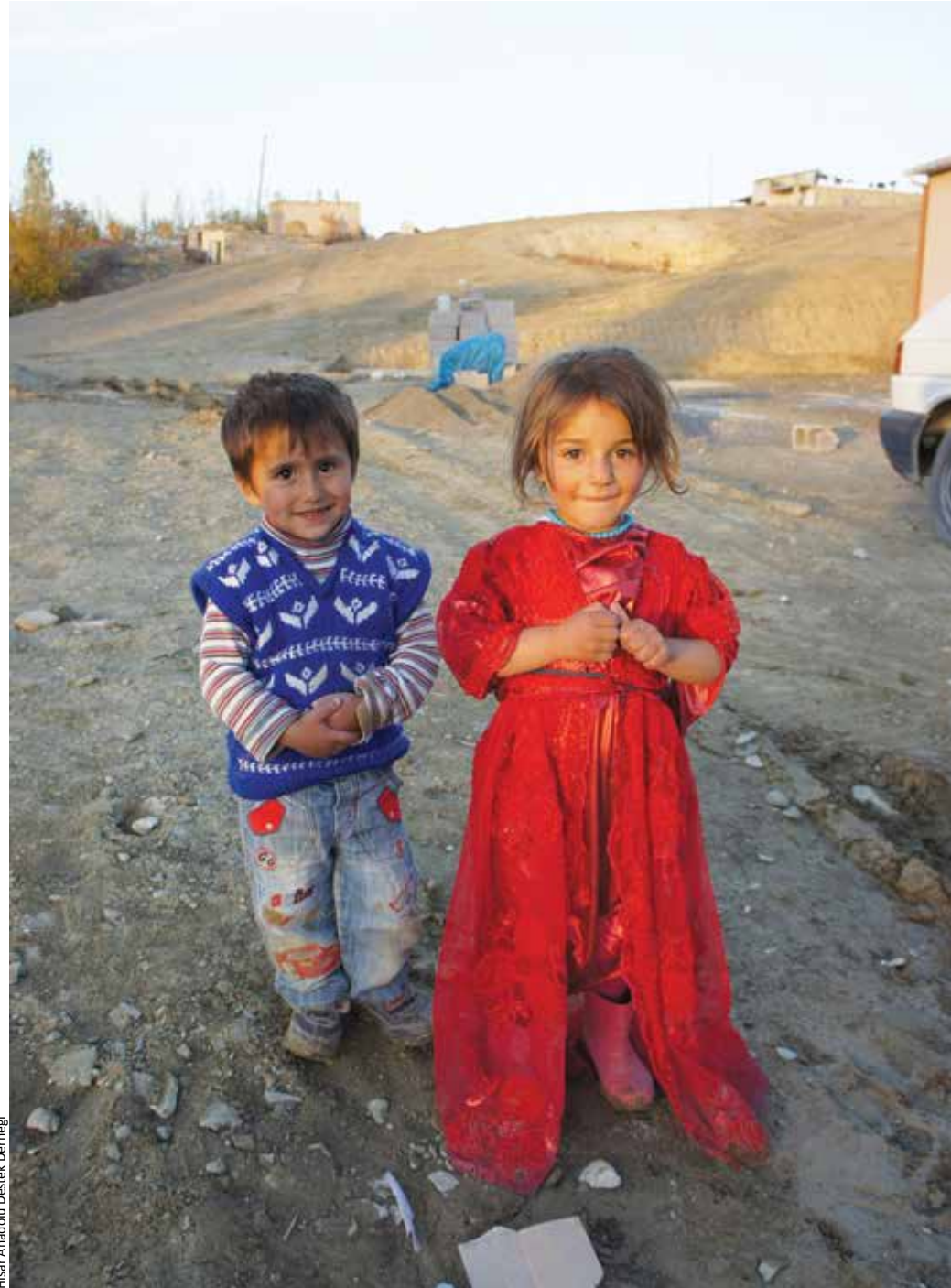
Hisar Anadolu Destek Derneği