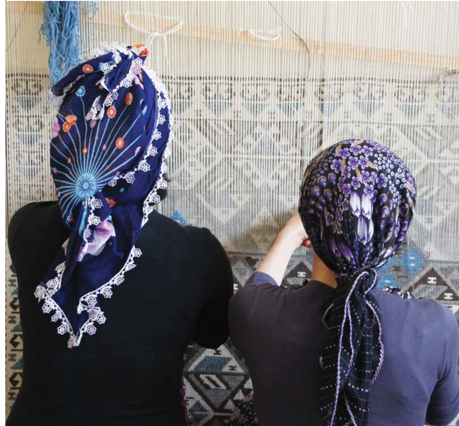
Hisar Anatolian Support Society Kilim Workshop

Hisar Anatolian Support Society empowers women by generating income and creating employment for women of East Anatolia through training on handmade carpets and kilim. The kilim studios built by the Hisar Society targets women and girls who had to migrate to big cities due to terrorist activities in their villages.