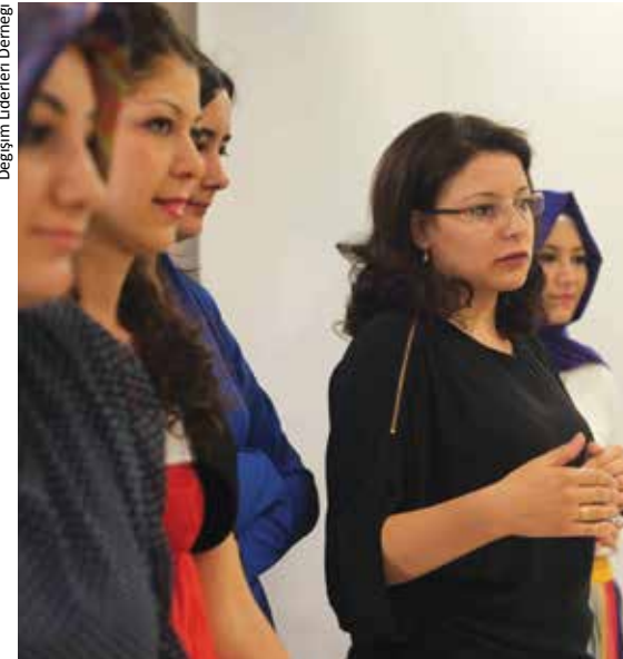
Değişim Liderleri Derneği