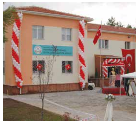
Special Needs School Opening in Eskişehir